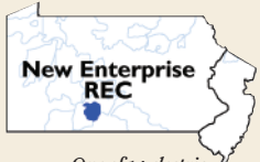
One of 14 electric cooperatives serving Pennsylvania and New Jersey

3596 Brumbaugh Road P.O. Box 75 New Enterprise, PA 16664-0075 814/766-3221 • 1-800-270-3177 FAX 814/766-3319 Website: www.newenterpriserec.com