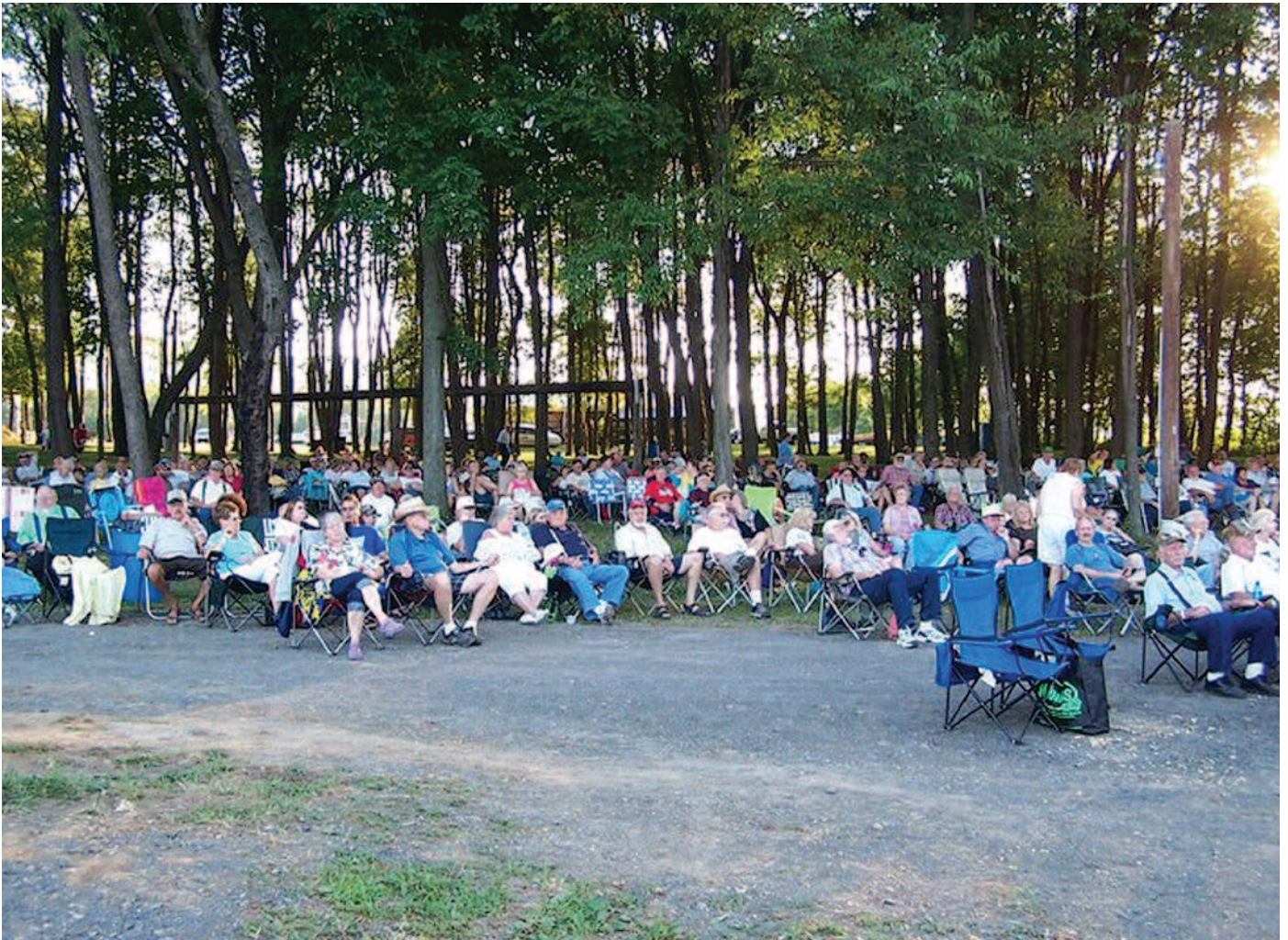
MADE IN THE SHADE: Spectators listen to the sound of bluegrass while enjoying the shade at the Southern Cove Bluegrass Festival.

The Southern Cove Power Reunion Grounds is located at 145 Cave Road, New Enterprise, PA 16664. Additional information can be found online at www.southerncovebluegrass.com or contact Tina Walter at 814/766-2676.