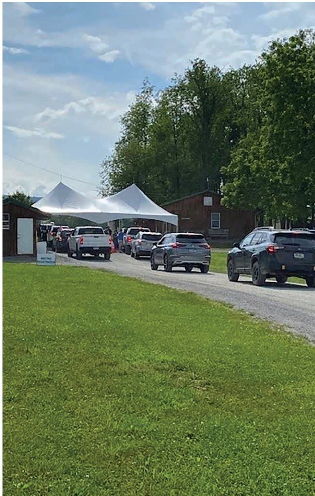
COME ONE, COME ALL: Members of New Enterprise REC line up to enter the cooperative's drive-thru annual meeting held at the Southern Cove Power Reunion Grounds in New Enterprise.

Also, thank you to everyone who attended the annual meeting and showed your pride in and support of New Enterprise REC. We hope you enjoyed it. If you have any questions or concerns, please stop by the office or give us a call at 814-766-3221. 📞