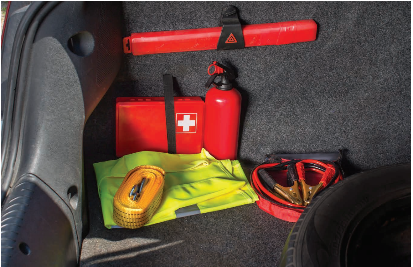
BE PREPARED: A roadside emergency kit – complete with a basic first aid kit and jumper cables – makes a great, practical gift for the holidays.

Visit SafeElectricity.org for other safety tips and information. 📄