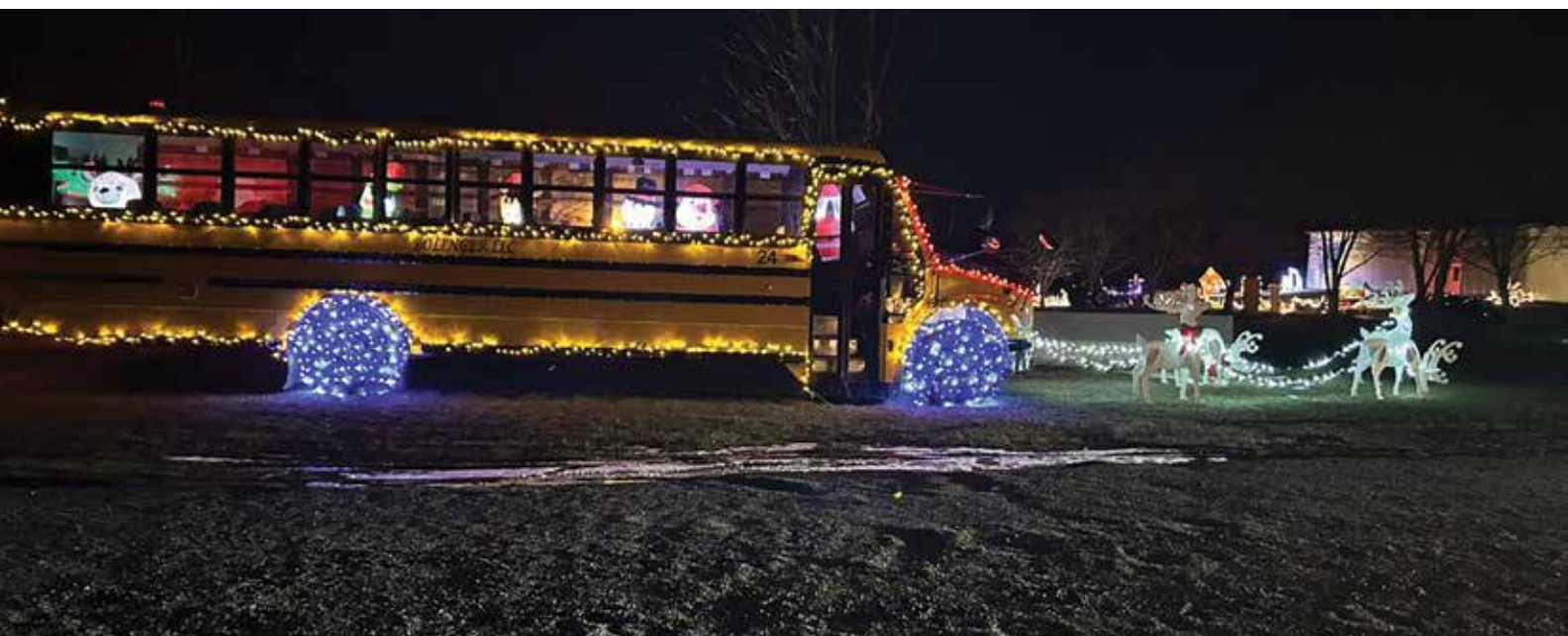
ON DONNER, ON BLITZEN: With the reindeer leading the way, Santa drove this Bolinger Bus to Southern Cove Power Reunion’s Christmas display.