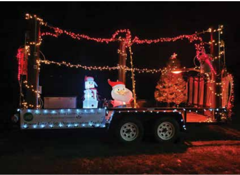
ON DISPLAY: Santa and Frosty found their way to New Enterprise Rural Electric Cooperative’s display.