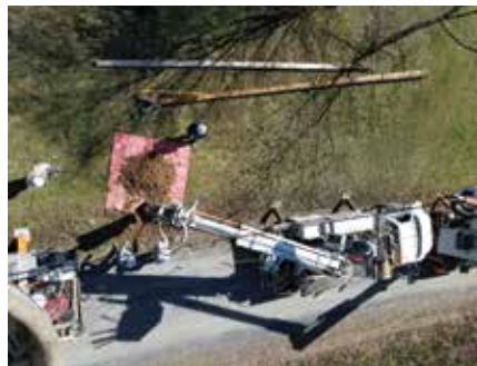
40 FEET UP: This is the view our lineworkers see when they are 40 feet in the air.

“Lineworker” is listed as one of the top 10 most dangerous jobs in the U.S. This is understandable as they perform detailed tasks near high-voltage power