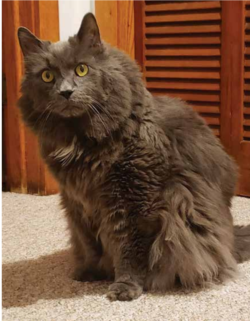
OSCAR, THE COMFY CAT: You can make your home more comfortable this winter for everyone, including the family pets, without taking a big “bite” out of your budget. Just ask Oscar.

If possible, elevate your pet's bed so it's not placed directly on a cold floor. An old chair or sofa cushion works well. If you don't use a dog bed, take some old blankets and create a donut shape on the cushion so the dog can snuggle and “nest” within the blanket. You can do the same for cats, but on a smaller scale. Blankets enable pets to nestle into them, even when they aren't tired, and pro-