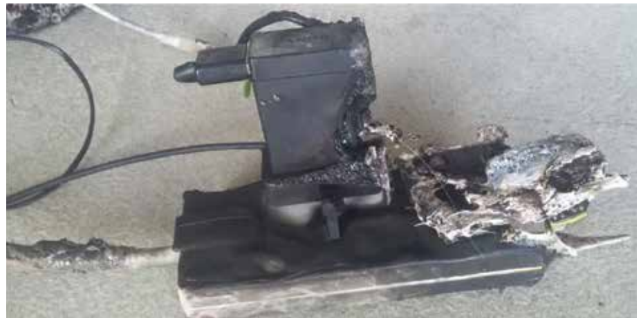
SAY NO TO KNOCKOFFS: Cheap, generic chargers can cause big problems for you and your devices.

Along with a potential burn and fire hazard, using cheaply made charging components and devices can also cause shock and electrocution. Serious potential dangers aside, they may also cost you more in the long run since they can cause damage to your phone,